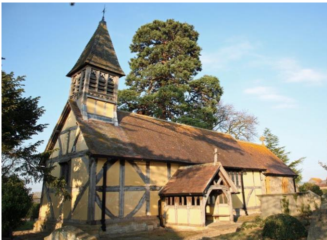
10.30am St Peter's Chapelry, Besford (HC)

The church services this week will be at: