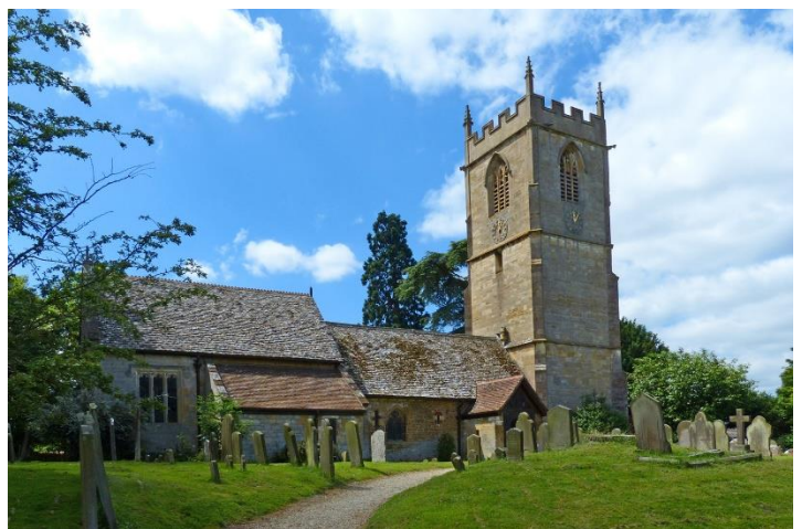
10.30am St Peter's, Little Comberton (MP)